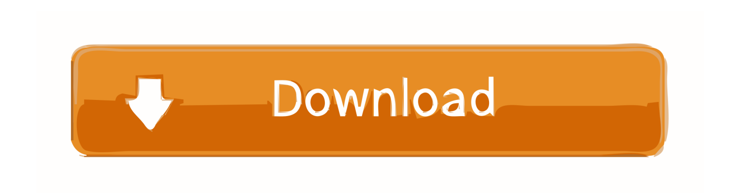
BIM 360 Docs 2005 Scaricare Keygen 64 Bits